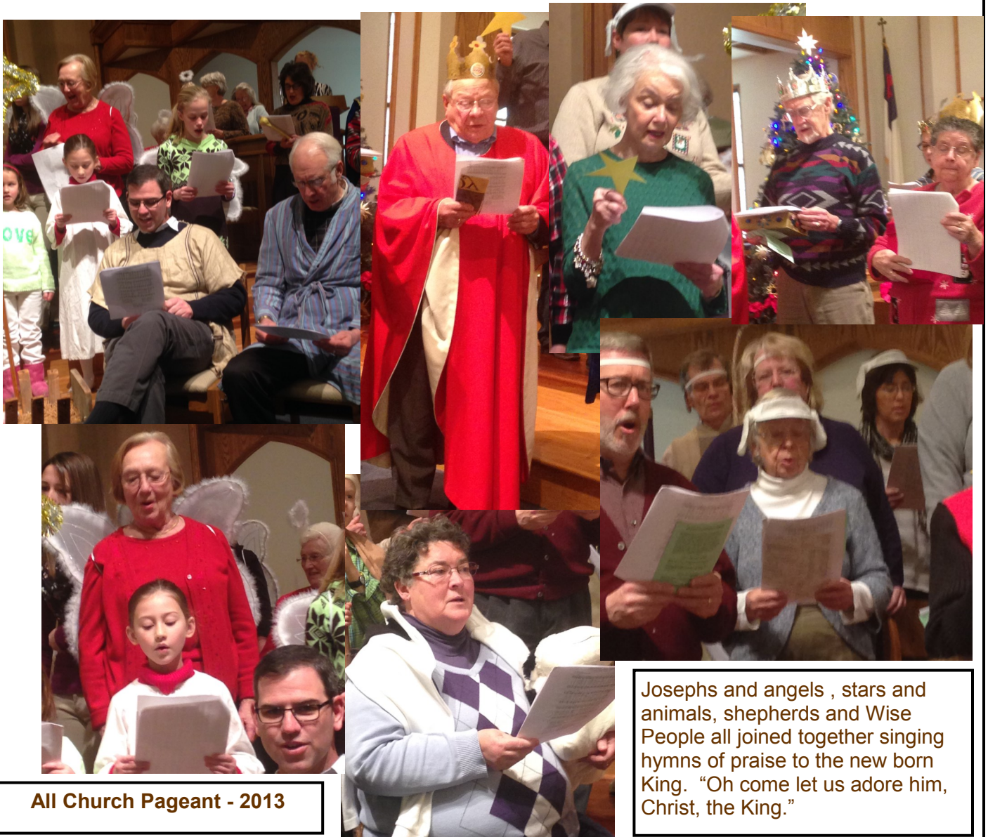
All Church Pageant - 2013

Tentatively the dates for the next session of WOW is set for January 15 to February 19. Please watch the Church Happenings and bulletins for more information.